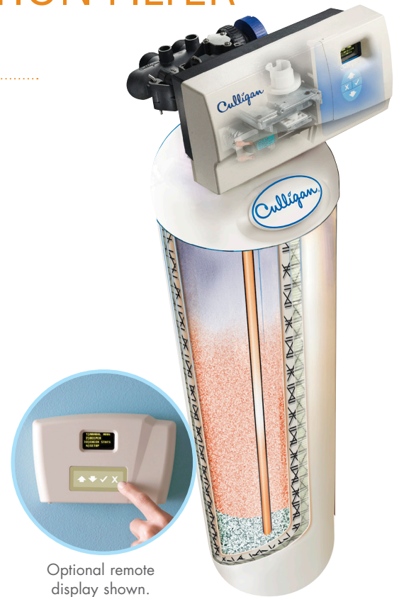
Optional remote display shown.